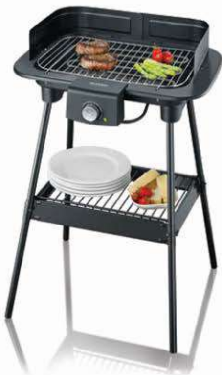
Table-top/table grill "Citygrill Edition"